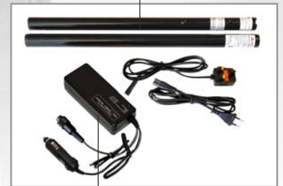
Solo 726 Fast Charger