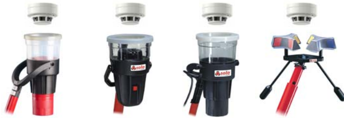
Solo 330 Aerosol Dispenser