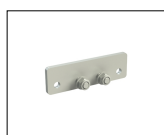
KT248 Front bracket support with M8 pins for MONOS4.