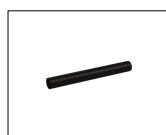
HT420 Stem cover for MONOS4 series.